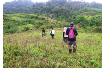
Forest technicians walking through a cattle pasture to investigate reported forest loss.

The territorial alerts web map is one way we are helping Wounaan to monitor and bring attention to the threats to their forests during this pandemic. Thank you US Forest Service International Programs for supporting this important work.